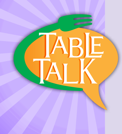
Table Talk A Lenten Family Devotional

During Lent (March 9-April 18), make it a priority for your family to have dinner together once a week - no TV, no DS, no iPad, no distraction. At that dinner, use the MDPC app to read through that week's Table Talk devotional, pray, talk about your day, and enjoy one another. Together, celebrate your faith in the risen Jesus!