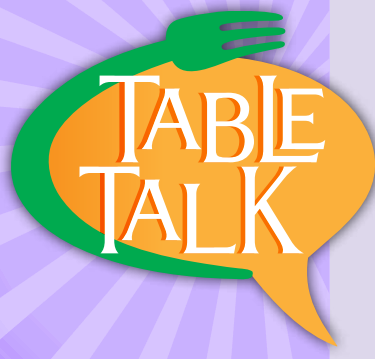
Table Talk A Lenten Family Devotional

During Lent (March 9-April 18), make it a priority for your family to have dinner together once a week - no TV, no DS, no iPad, no distraction. At that dinner, use the MDPC app to read through that week's Table Talk devotional, pray, talk about your day, and enjoy one another. Together, celebrate your faith in the risen Jesus!