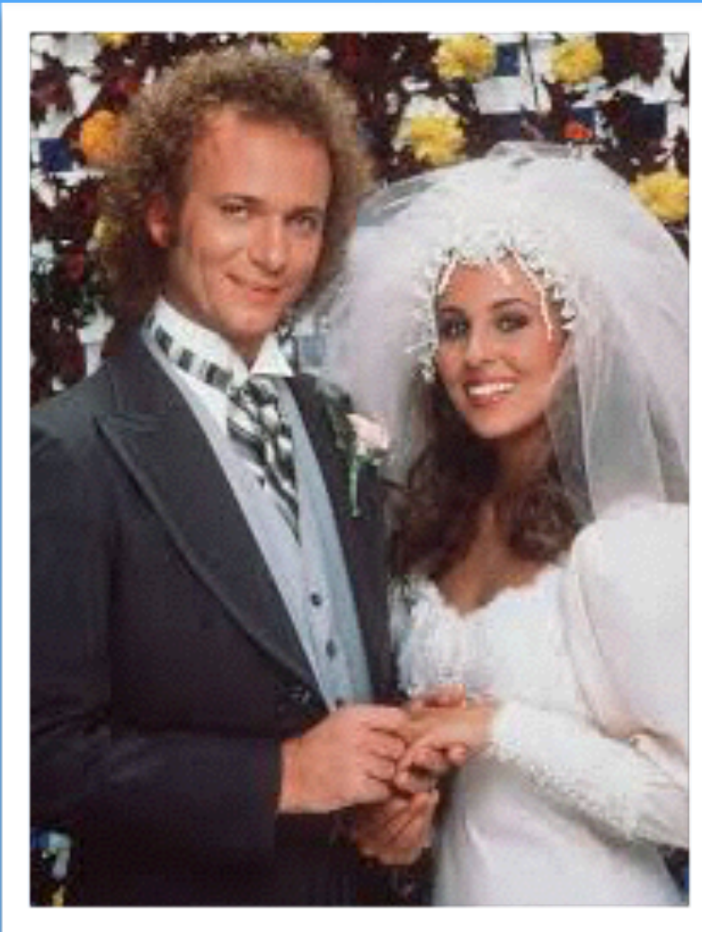
Luke and Laura

...”The unspeakable at the disco, the breakdown, the brainwashing, the deadly virus and of course the wedding of the century!”