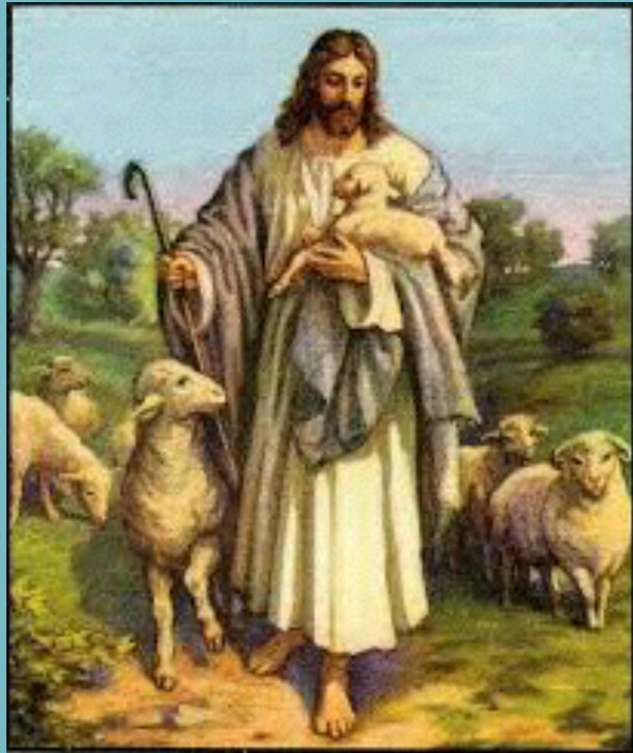
Jesus the Humble Shepherd